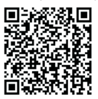
[Android & iOS]

2. For further information please visit server.growatt.com